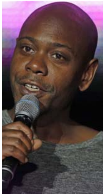
Dave Chappelle

by: Mesfin Fekadu AP Entertainment Writer