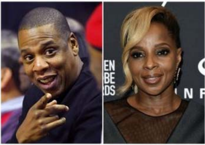
Jay-Z and Mary J Blige

LOS ANGELES (AP) — Mary J. Blige and Jay-Z are the leading nominees with five apiece for January's NAACP Image Awards, the group announced Monday.