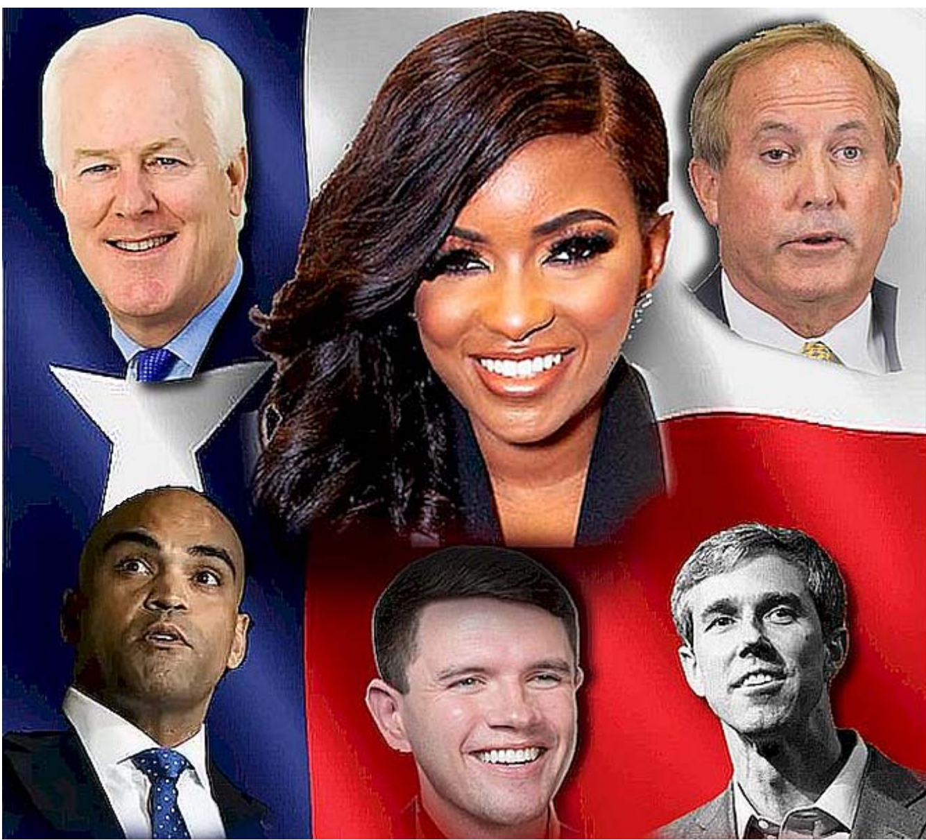
Top row (L-to-R): John Cornyn, Jasmine Crockett, Ken Paxton. Bottom row (L-to-R): Colin Allred, Beto O'Rourke.

EDITORIAL: Why I Voted for Talarico — And Why Texas Isn't Ready to Elect Jasmine Crockett Statewide