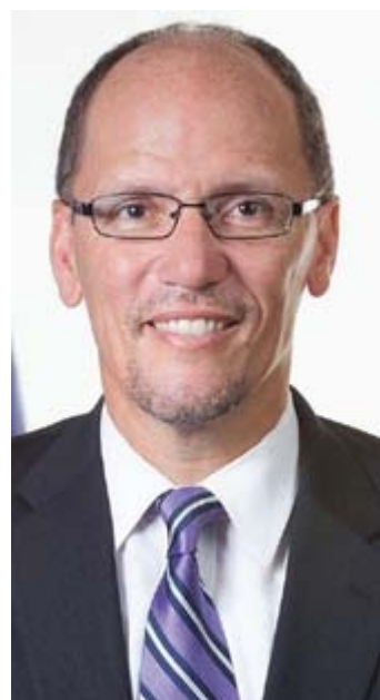
DNC Chair Tom Perez

DNC Press - "Donald Trump continues to take credit for the strong economy he inherited from President Obama. But instead of rewarding American workers for fueling our nation's prosperity, Trump and Republicans in Congress have given massive tax cuts to big corporations and the top 1% at the expense of the middle class - all while workers at companies like Carrier and Harley-Davidson continue to lose their jobs. Meanwhile, African-American unemployment saw the largest increase in years, despite Trump's claims during the State of the Union that his policies were helping African-American families. We should be building an economy that works for all, not rigging it to serve the rich. The Trump administration's policies are putting at risk all of the progress we made under Barack Obama."