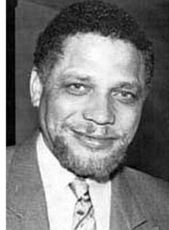
Congressman Mickey Leland 11/27/1944 - 8/7/1989

George Thomas "Mickey" Leland was America's most effective spokesman for hungry people in the United States and throughout the world. During six terms in the Congress, six years as a Texas state legislator and, Democratic National Committee official, he focused much needed attention on issues of health and hunger and rallied support that resulted in both public and private action. Leland combined the skills of the charismatic leader with the power of a sophisticated behind-the-scenes congressman. He matured during his years in Congress into a brilliantly effective and influential advocate for food security and health care rights for every human being. When