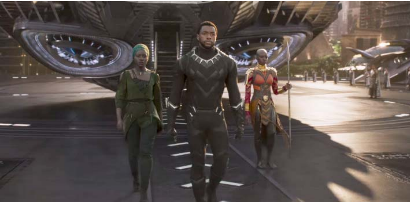
Trailer screen from the new upcoming superhero movie "Black Panther", in theaters February 16. (Marvel Studios/Disney)

National News - There's a Black Panther party going on all around the country.