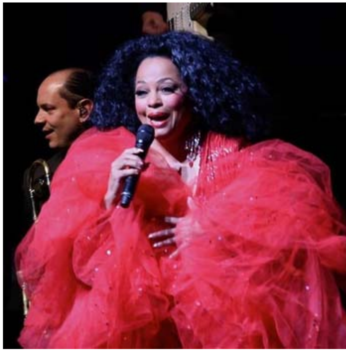
Diana Ross performs on stage at Austin's ACL Live at The Moody Theater (2013).

AUSTIN, TX - The beautiful and extremely talented DIVA that is Diana Ross hit ACL Live at The Moody Theater by storm on July 6, 2017. She came out struttin' her stuff on the stage in a lavish emerald green gown with a fluffy sequined-lace full-length shawl singing "Lady Marmalade" to a packed audience. In a remarkable career spanning over 40 years, Diana Ross has proven herself the consummate music artist as well as one of the most iconic female singers of all time.