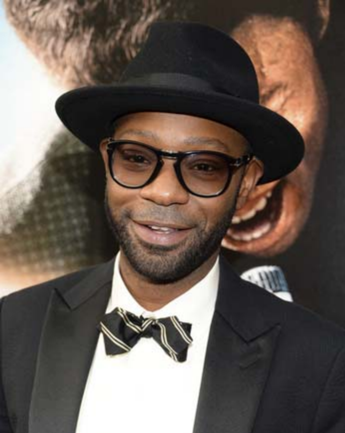
In this Monday, July 21, 2014 file photo, actor Nelsan Ellis attends the world premiere of "Get On Up" at the Apollo Theater in New York.

NEW YORK (AP) — Actor Nelsan Ellis, best known for his memorable portrayal of Lafayette Reynolds on HBO's "True Blood," has died at the age of 39.