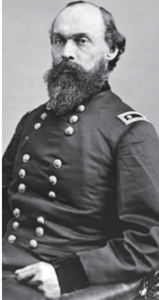
Major General Gordon Granger

JUNETEENTH CELEBRATION OF THE END OF SLAVERY PROCLAMATION, ISSUED