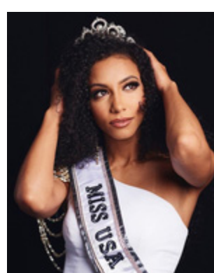
Cheslie Kryst MISS USA