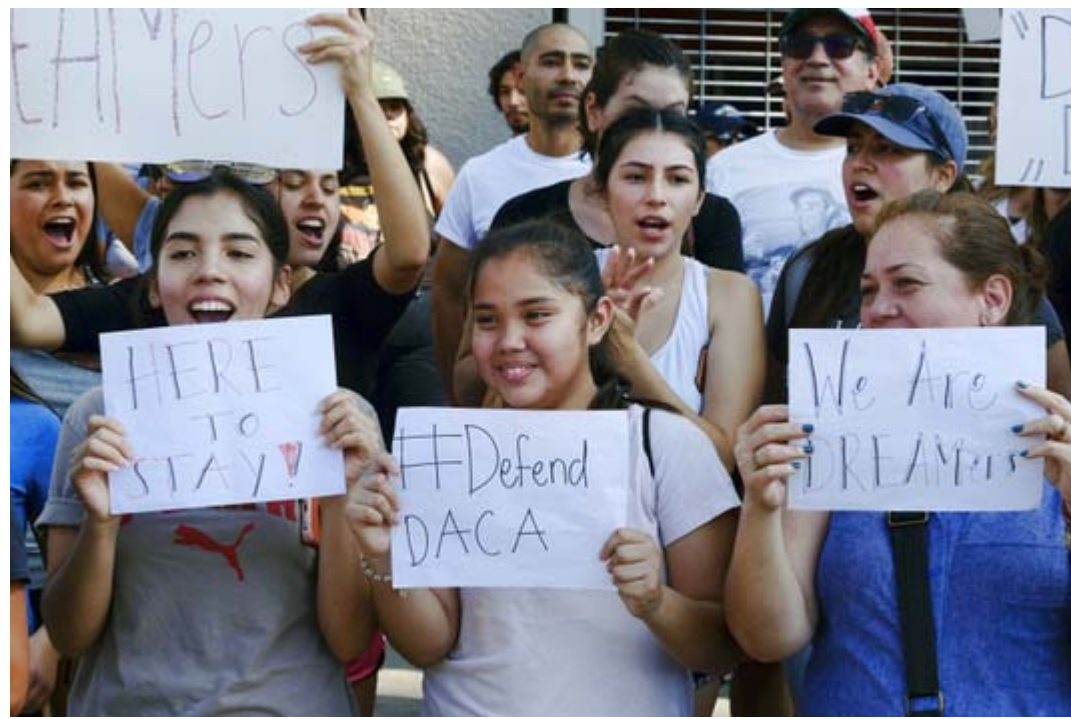
Supporters of the Deferred Action for Childhood Arrivals, or DACA, chant slogans and holds signs while joining a Labor Day rally in downtown Los Angeles on Monday, Sept. 4, 2017. President Donald Trump is expected to announce this week that he will end the Deferred Action for Childhood Arrivals, but with a six-month delay, according to two people familiar with the decision-making.