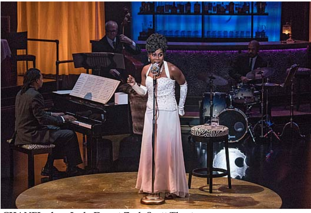
CHANEL plays Lady Day at Zach Scott Theatre.