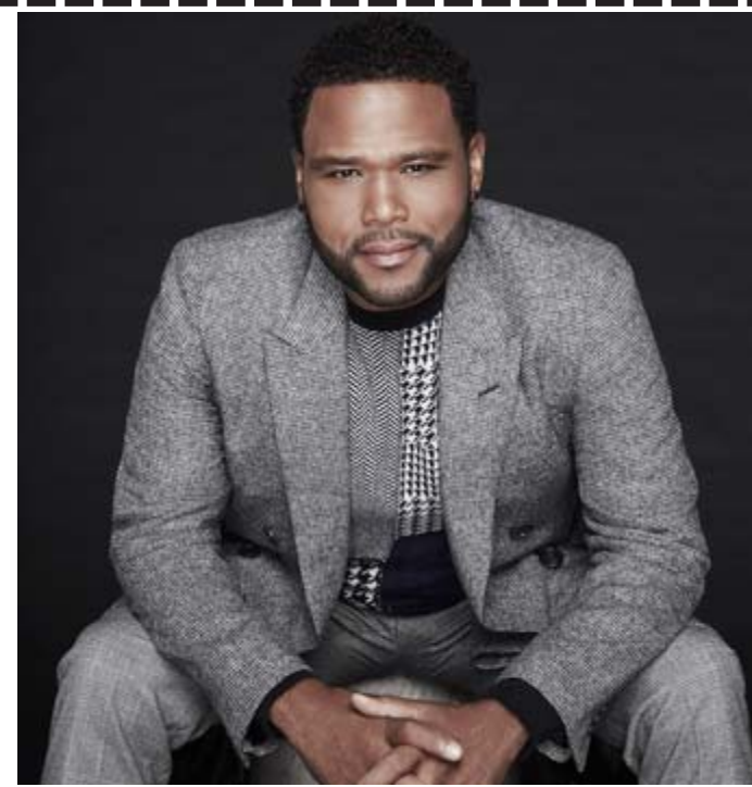
Anthony Anderson Media Photo courtesy of the NAACP Image Awards/TV One.

for the 49th NAACP Image Awards and the latest news, please visit the official NAACP Image Awards website at: http://www.naacpimageawards.net .