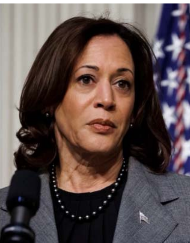
L-R: Tennessee Republican Rep. Andy Ogles and Vice-President Kamala Harris. According to the Bipartisan Policy Center, the 25th Amendment has only been invoked a handful of times, and the application that Ogles is calling for, Section 4, has actually never been used in American history.

a concern that has been amplified since the June 27 presidential debate on CNN.