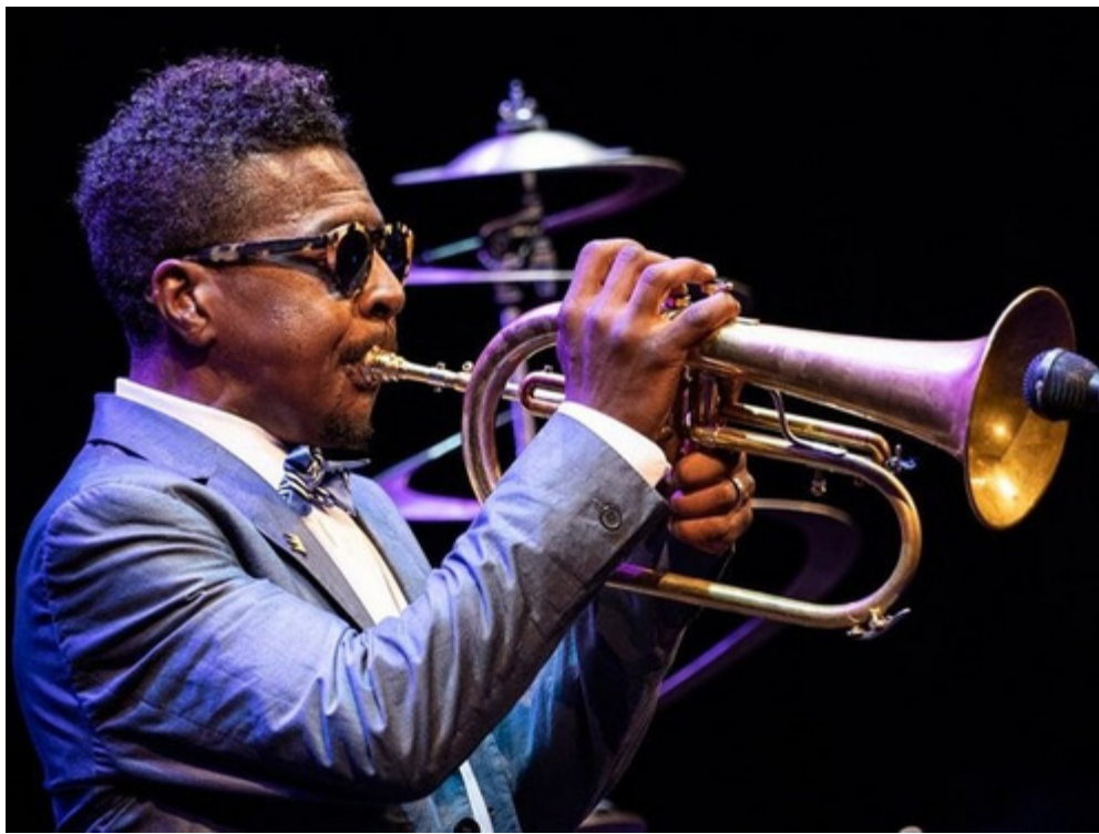
Grammy-award winning trumpeter Roy Hargrove.

Hargrove performed with jazz gods like Sonny Rollins, Stanley Turrentine, David "Fathead" Newman, Herbie Hancock, Wynton and Branford Marsalis. But he seamlessly also collaborated with R&B and Pop stars. Hargrove worked on Erykah Badu's critically acclaimed album Mama's Gun in 2000, as well as her 2003 album Weather Underground . He also contributed to D'Angelo's 2000 album Voodoo , as well as his 2014 offering Black Messiah .