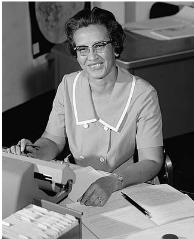
KATHERINE JOHNSON at NASA in 1966.

As a nation, we must remember and honor Katherine Johnson (8/26/1918 – 2/24/2020) not only during Women’s History Month, but also keeping