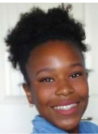
Kennedy George Weiss High School

This week was the first week of school for Pfisd students. On the first day of school we had a two hour delay because of rain, wind and some flooding. This year is my first year in high school so I have never had an "A day" "B day" schedule before. I have four classes a day. I have band both 'A' and 'B' day, and it is one of my favorite classes.