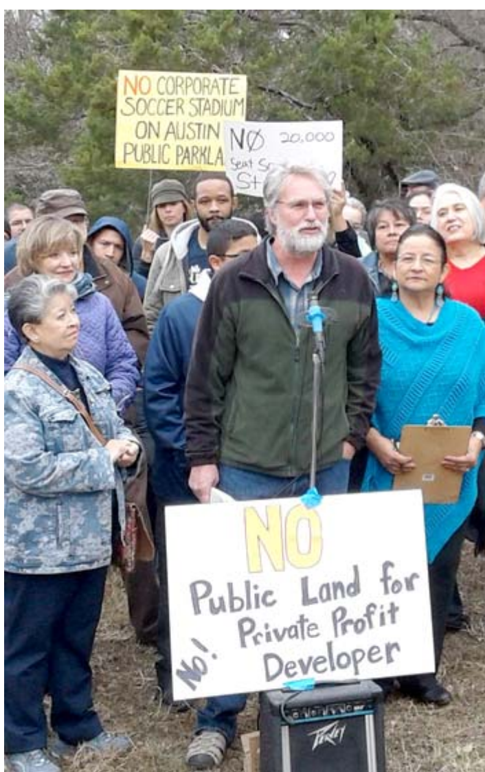
East Austin protest against soccer stadium in East Austin.