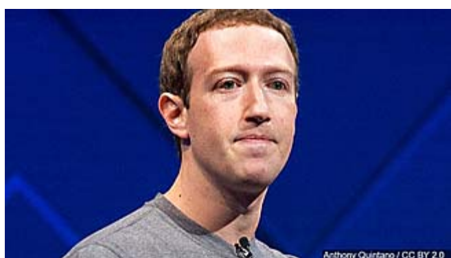
Mark Zuckerberg, President and CEO of Facebook