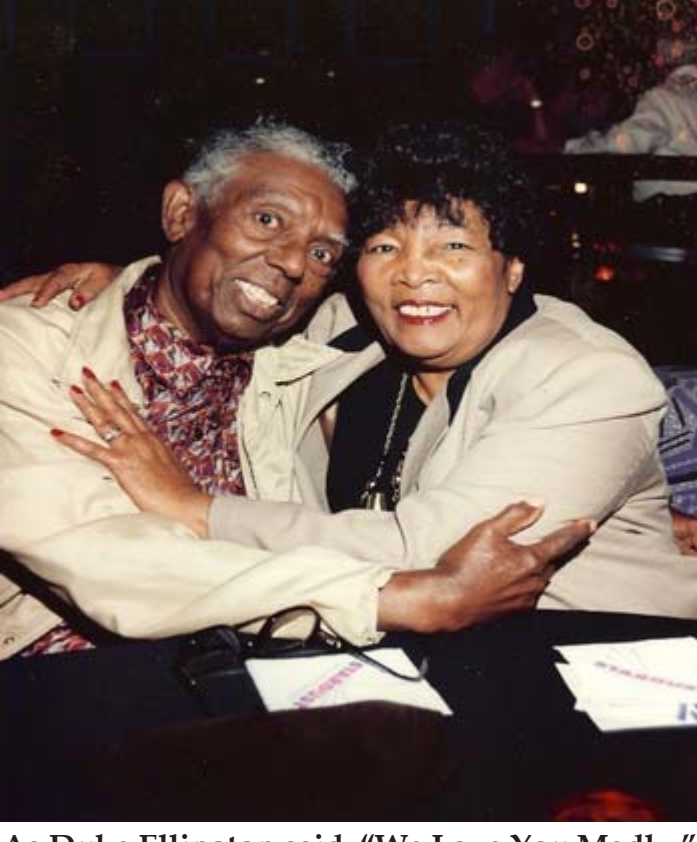
As Duke Ellington said, "We Love You Madly."

72 nd Wedding Anniversary December 3, 2017