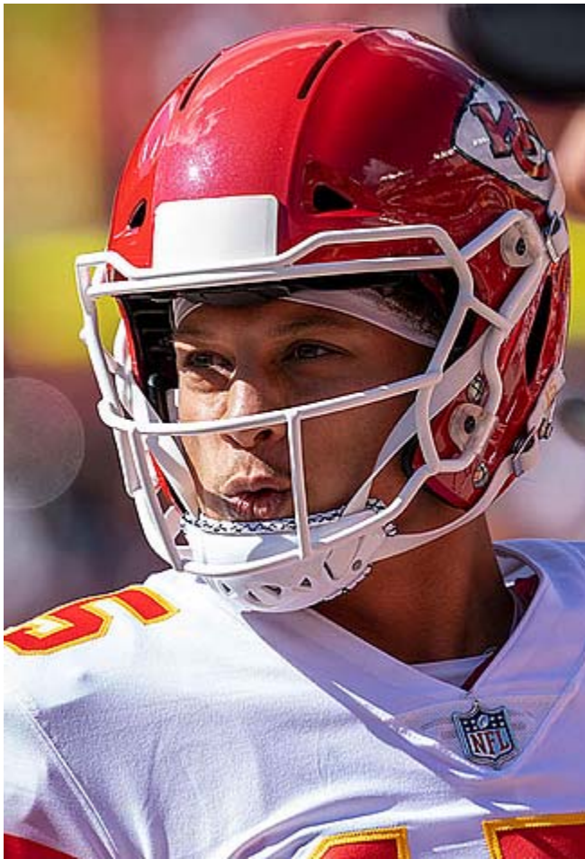
Kansas City Chiefs quarterback, Patrick Mahomes.

The 2023 NFL Draft marked the first time in NFL history Black men were selected in the top three positions for quarterback. The position was once seen as a white male-dominated one until players such as Michael Vick and Randall Cunningham revolutionized the position and the game of