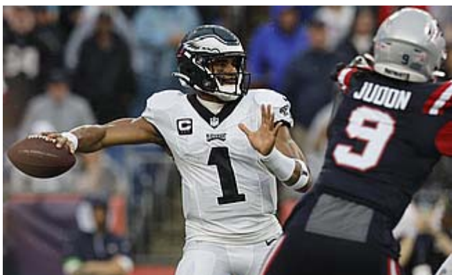
Philadelphia Eagles quarterback Jalen Hurts (1) looks for an opening while under pressure from New England Patriots linebacker Matthew Judon (9) in the first half of an NFL football game, Sunday, Sept. 10, 2023, in Foxborough, Mass.

In 1988, Washington Redskins QB Doug Williams made history in Super Bowl XXII (1988) when he became the first Black quarterback to win a Super Bowl. He led them to a victory and was named the game's MVP. Philadelphia Eagles QB Randall Cunningham was known for his athleticism in the 1980s and 1990s. Cunningham was a four-time Pro Bowl selection. While there have been significant strides in the representation of Black quarterbacks in the NFL, there is ongoing recognition of the need for continued diversity and inclusion in all positions in professional football — including owner and head coach.