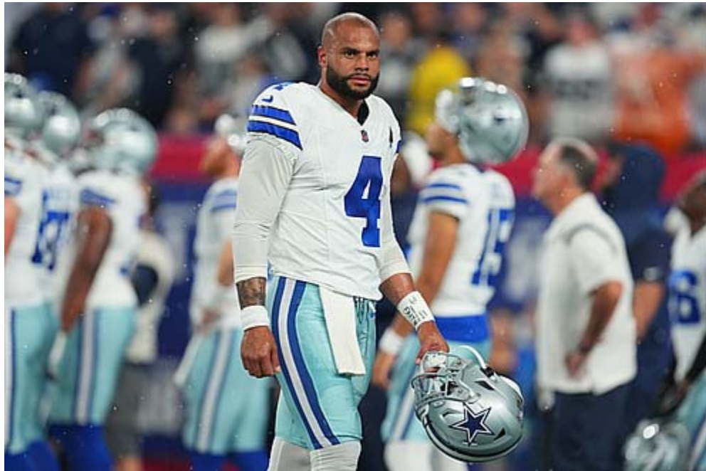
Cowboys' Dak Prescott (#4) Praised as 'Best Leader I've Ever Seen' at QB by Dallas team owner, Jerry Jones.

In the 1980s, Houston Oilers QB Warren Moon became one of the most prominent Black quarterbacks in NFL history. Moon started as a star in the Canadian Football League before joining the NFL in 1984. He had a highly successful NFL career, earning nine Pro Bowl selections and be-