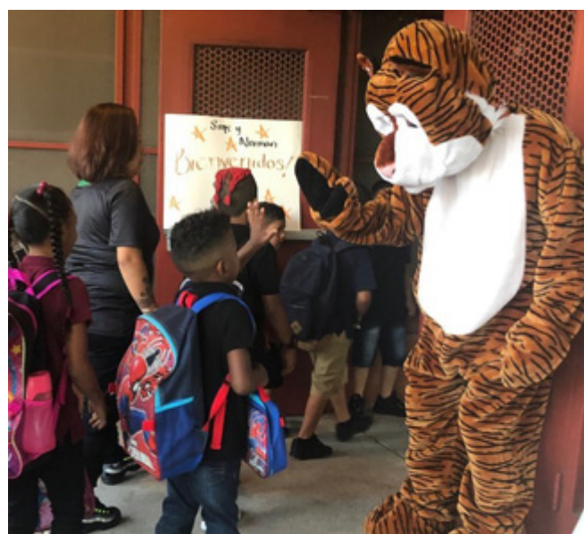
Children high-fiving the Norman Tiger as they start first day of school.

The Norman and Sims community gather to welcome the game changers of the future back to school.