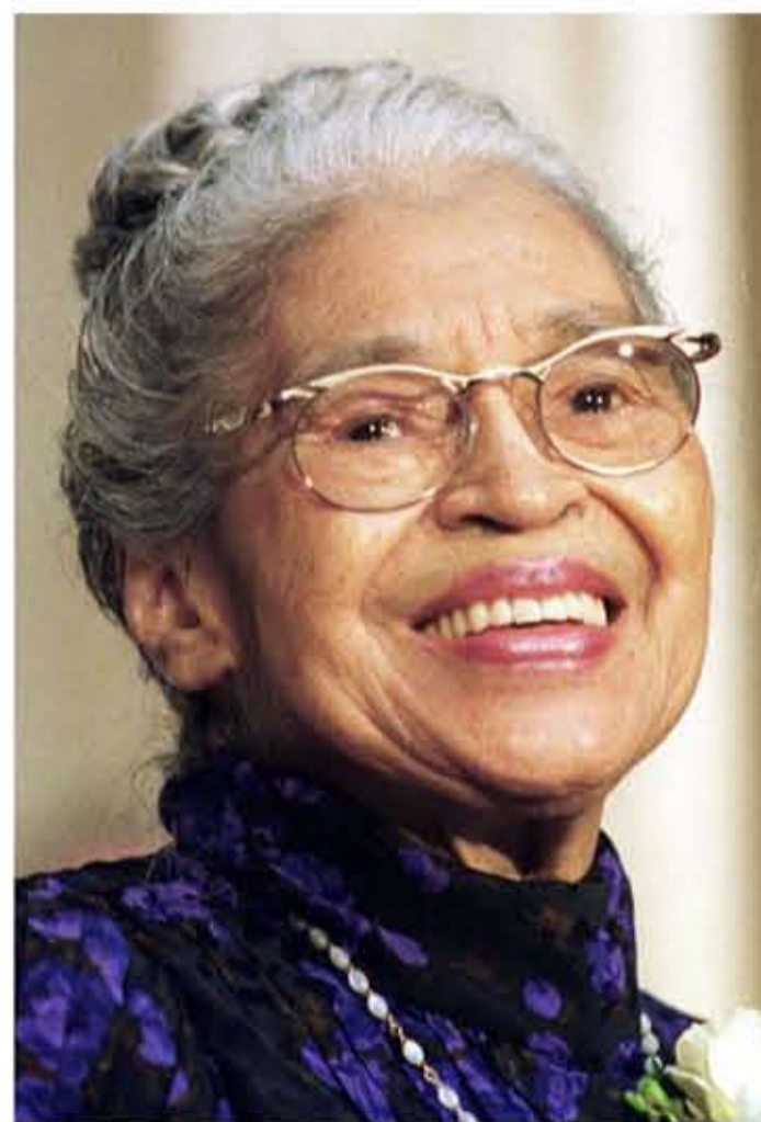
Parks, Rosa Louise, 1913-2005

sides in Bastrop, Texas with his wife and kids. His career in music spans over four decades. This journey has seen him go from the cotton fields of Elgin, Texas, where he heard the hymns of his grandparents, to the stages of Carnegie Hall and much of the world.