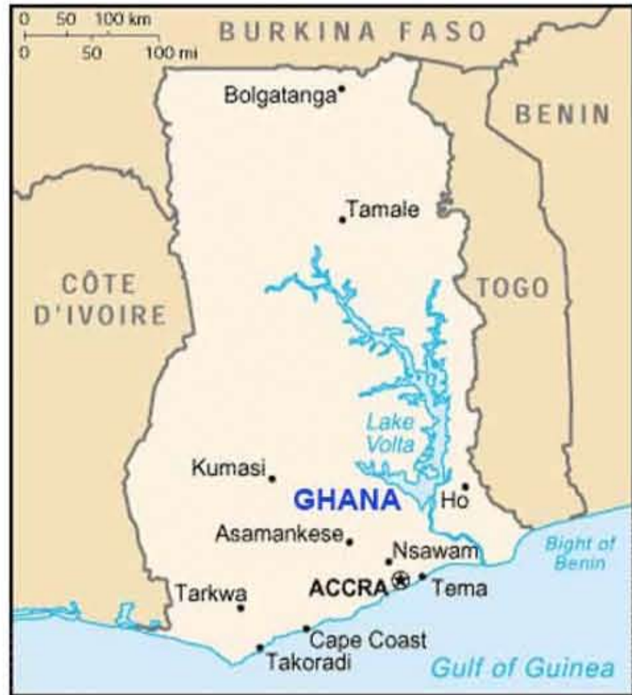
Map of Ghana

Furthermore, numerous African American have settled in Ghana, which can be estimated into the thousands. Finally, the official visit of president Obama marked Ghana reinforcing the historic and future link between the nation of Ghana and the United States.