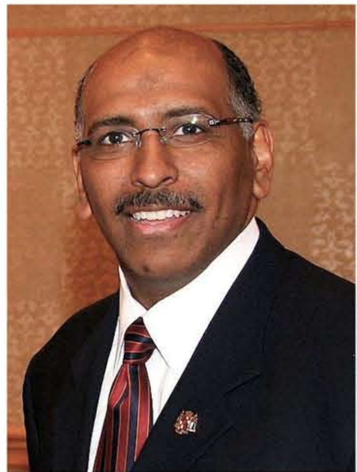
Michael Stephen Steele 63rd Chairman of the Republican National Committee

Black political operatives will remain subservient, passive, meek, docile, and deferential as long as they continue to abdicate their authority to address issues that specifically speak to the condition of Black people. Let us see more Black political leaders on CNN, FOX, and MSNBC. I intentionally did not include BET because Viacom is only interested in