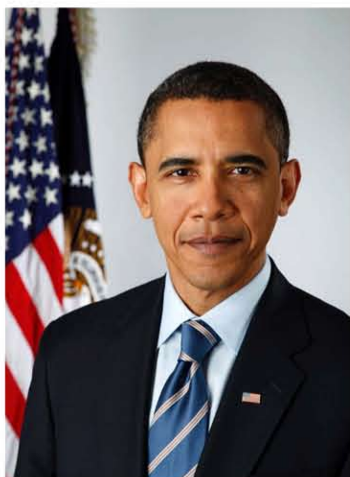
President Barack Obama

FAIRFAX, Va. (March 12, 2010) The White House has announced that President Barack Obama has donated $125,000 from his Nobel Peace Prize proceeds to UNCF. UNCF will allocate the donation to its Campaign for Emergency Student Aid. UNCF is one of ten organizations the president chose to receive a share of the cash award that accompanies the Nobel Prize. Other recipients included the Clinton-Bush Haiti Fund, the Central Asia Institute, and the Appalachian Leadership and Education Foundation.