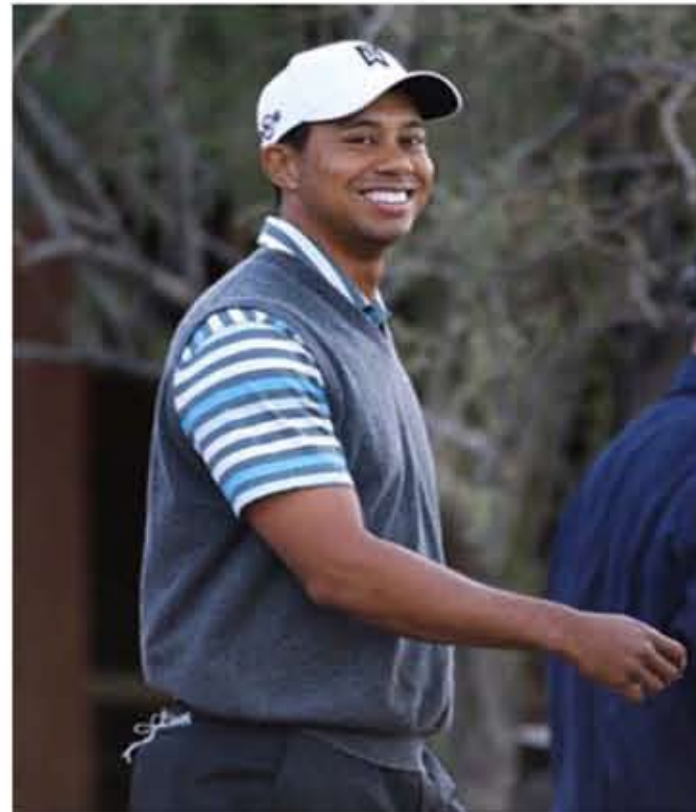
Tiger Woods, Worlds number 1 golfer readies for comeback