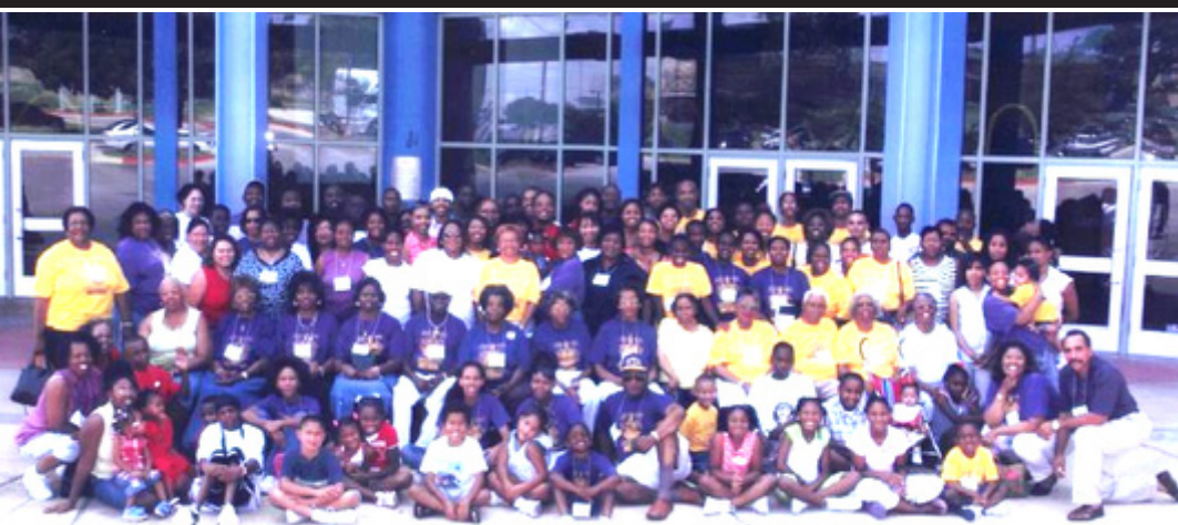
Sorrells Family Reunion July 31st 2004 Austin, Texas

The Sorrells Family will be celebrating their 31st reunion this weekend July 27-29, 2012 in Austin, Texas.