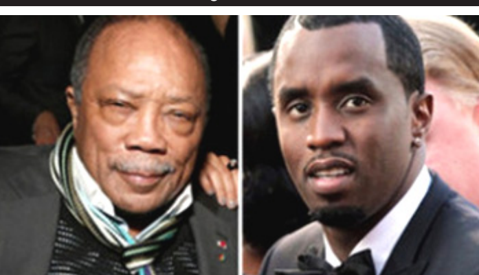
(L to R) Quincy Jones and P. Diddy

Special to the NNPA from the Tri-County Sentry Quincy Jones is certainly one of the most influential producers of all time, having lent his midas touch to everyone from Ray Charles to Michael Jackson. As such, he's an authority on music and is entitled to give his opinion on the careers of others in the industry. And he had Diddy on his mind.