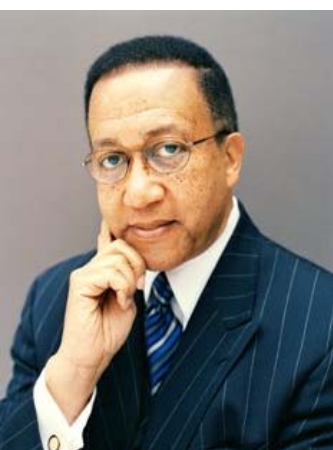
By Dr. Benjamin F. Chavis, Jr. NNPA Columnist

Lest we forget, the price for our right to vote was life-sacrificed, blood-soaked, jail-filled, and tear-wrenched. As we approach the national elections on November 6, I am concerned that there is an urgent necessity to increase Black American voter registration, mobilization and overall enthusiasm. This is not the time for the apathy of pessimism or the dysfunction of cynicism. We should not wait until a few weeks or days before the elections to understand and affirm the critical impor-