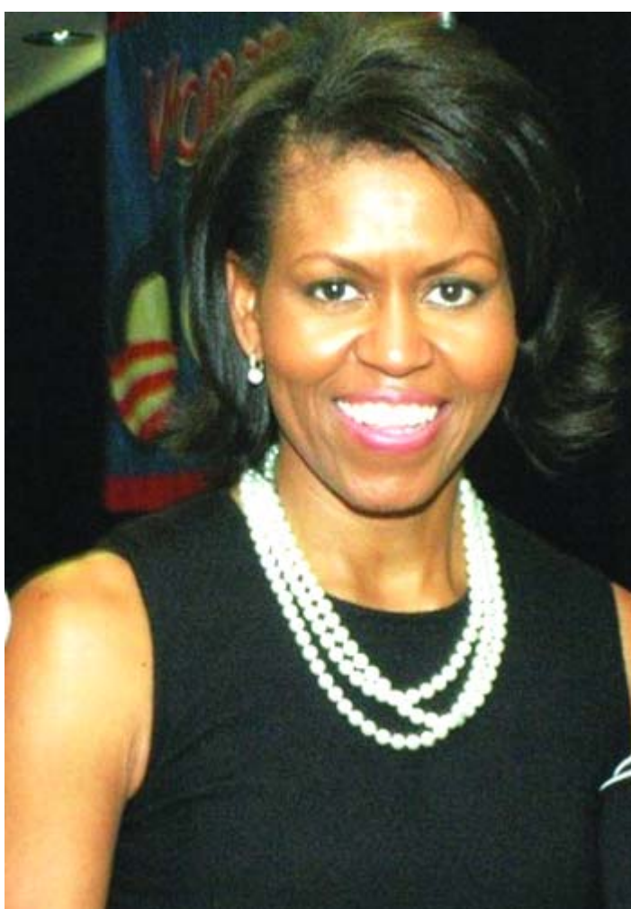
First Lady Michelle Obama

A story in the Washington Post reported that several police officials were present at breakfast when the officer used "his mobile phone to display a picture of