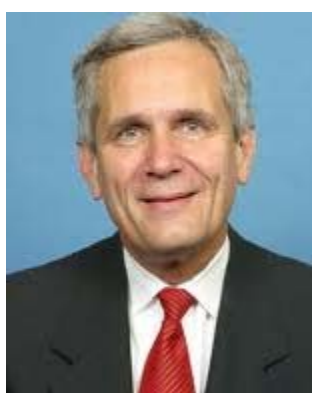
Rep. Lloyd Doggett

Washington—Today, U.S. Rep. Lloyd Doggett (D-TX), a senior member of the House Ways and Means Committee, introduced a bill that would extend the American Opportunity Tax Credit (AOTC) through 2013 to make college more affordable for millions of families. Without Rep. Doggett's bill, the AOTC would expire at year's end.