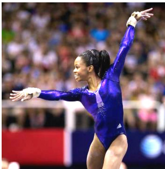
Gabby Douglass 16, has been training as a gymnast since age 3.

Gabby made her senior debut in 2011. She qualified to her first Senior National Championships in