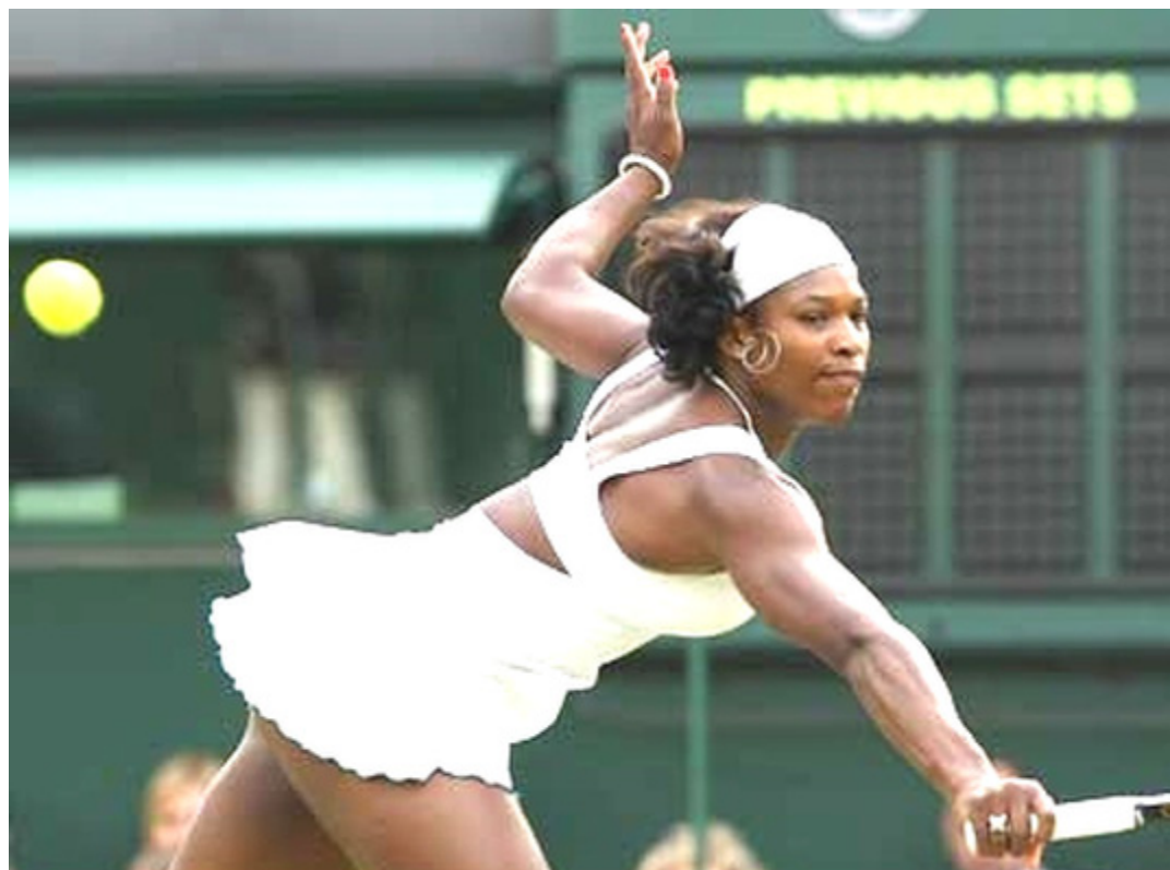
Wimbledon Champion Serena Williams