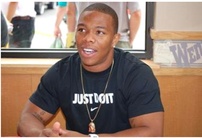
Ravens running back Ray Rice.

"Going into the eighth grade, a girl kept on picking on her," Rice said. "The girl threw a rock, hit my sister in the eye, and my mother's first reaction was to tell her to retaliate. That wasn't the right answer. We got the principal involved, we got the police involved. I think we got it under control. We haven't had a problem since. My sister is