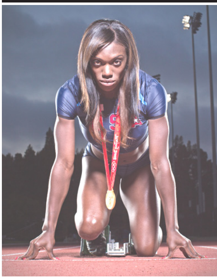
Dawn Harper (UCLA)