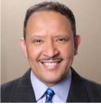
By. Marc H. Morial NNPA Columnist

"People who don't vote have no line of credit with people who are elected and thus pose no threat to those who act against our interests." Marian Wright Edelman