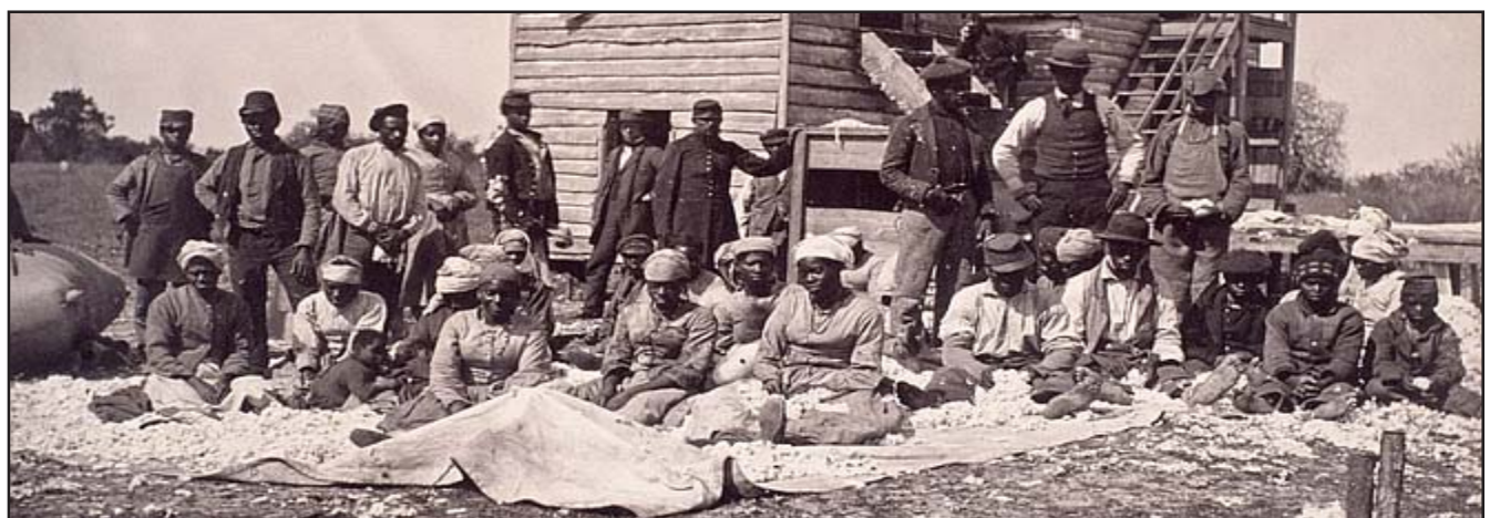
A group of escaped slaves that gathered on the former plantation of Confederate General Thomas Drayton. After Federal troops occupied the plantation these former slaves began to harvest and gin cotton for their own profit, circa 1862.