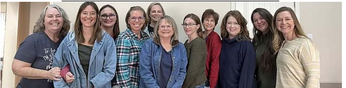
There are Midwives Associations throughout the state of Texas.

from the Texas Department of Licensing & Regulation