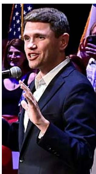
Texas State Rep. James Talarico

It's a pattern now. Every attempt to sideline him seems to ricochet back with more force. When a national