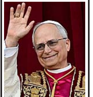
Pope's mea culpa wasn't just pathetic; it was insulting. See APOLOGY Page 3

What are the tools young Black Americans lack to generate generational wealth? See ACCESS Page 3