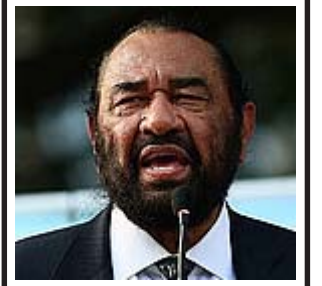
A changing of the guard in Texas. See CHAPTER Page 2